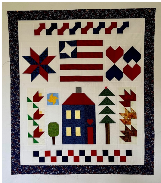
10" (finished) Sawtooth Star Block